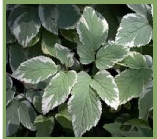
Bishop's Goutweed.

If you would like to know more, or happen to spot bishop's goutweed please contact TIP via our website ( www.timberlandinvasives.org ), email ( timberlandinvasives@outlook.com ), or by phone (715-799-5710 ext. 3).