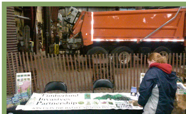
Timberland Invasives Partnership's booth at Buck Fever Night in Shawano.

November 17th was Buck Fever Night at the Shawano County Highway Department Building. TIP had a booth at the event, which had about 250 locals attend, and saw a wide variety of people including children of all ages with an interest in the outdoors. While at the booth we were able to engage in several conversations with the good folks of the Shawano area with many individuals being concerned about the threat buckthorn poses to their prime hunting lands. Due to the good turnout TIP is planning a repeat appearance next year.