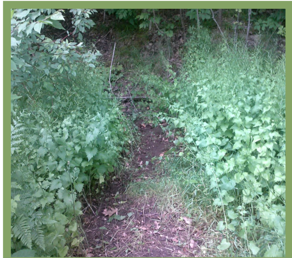
Garlic Mustard , an invasive species of great concern for Langlade County Forests.

On November 10th the Invasive Species Management Action Team met to develop TIP's Invasive Species Summary for the Langlade County Forestry Department. Turn out was good and the document is developing quickly. We hope to meet again for more revisions and finalization on January 6th. We hope to present our work at the January meeting of the Langlade County Forestry and Recreation Committee's meeting for their input and approval. For more information contact the TIP Coordinator.