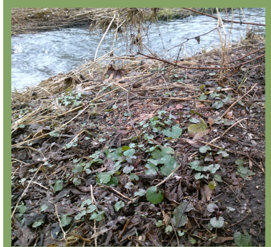
Garlic Mustard along Spring Brook on 3/11/2016.

For more information on Garlic Mustard, you can contact the TIP Coordinator, or visit the Wisconsin DNR's Website www.dnr.wi.gov/topic/invasives/ .