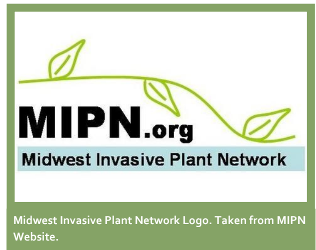
Midwest Invasive Plant Network Logo.

For those of you with questions on how to control Garlic Mustard mechanically, TIP recently acquired a great brochure from the Wild Rivers Invasive Species Coalition. For any questions on chemical control of Garlic Mustard we recommend visiting the Midwest Invasive Plant Network's Control Database ( mipncontroldatabase.wisc.edu ).