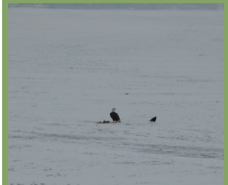
Eagle on Legend Lake, having breakfast during TIP's Annual Meeting