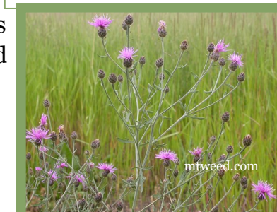
Spotted Knapweed In Bloom