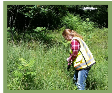
April “Nabbing Knapweed”

715-799-5710. There is plenty to go around.