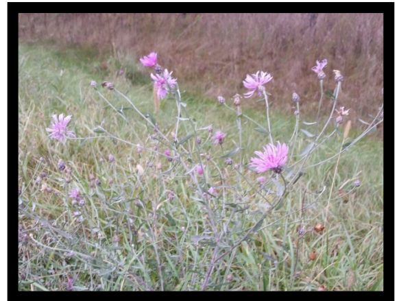
Spotted Knapweed in November