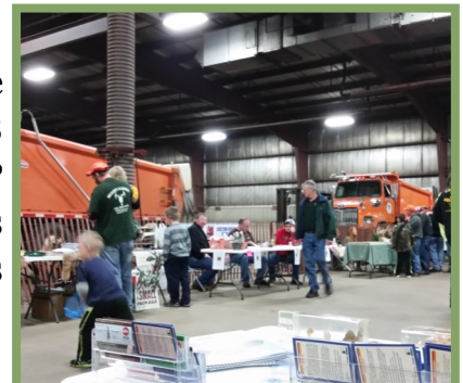
Buck Fever Night