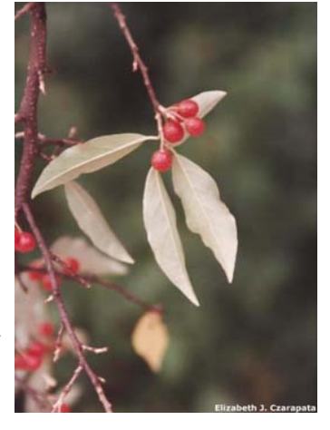
Above: Fruiting autumn olive, showing the silver undersides of leaves.

The plant has simple, alternate leaves, with a distinct silver-gray underside. Fruit becomes apparent right around this time of the year; they are egg-shaped and red in color. When controlling, cut stump treatment has been found effective, and if fruit are present, it's necessary to bag the trimmed branches to prevent further seed dispersal.