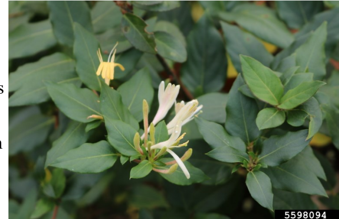
Ryan Armbrust, Kansas Forest Service, Bugwood.org

Within TIP's four-county area, there is no known populations of Japanese honeysuckle. If you think that you have seen Japanese honeysuckle, contact TIP to confirm the population.