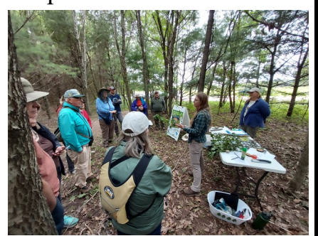
NRF Field Trip at Maple Hills

County Youth Conservation Field Days; over 200 5th graders from Shawano County Schools learned about natural resource topics/careers. TIP partnered with Suamico Elementary School to host an environmental education day for over 250 K-4th grade students. The students learned about the invasive species in their school forest. Finally, TIP participated in an education day with the Gillett School District teaching over 500 K-12th grade students about invasive worms.