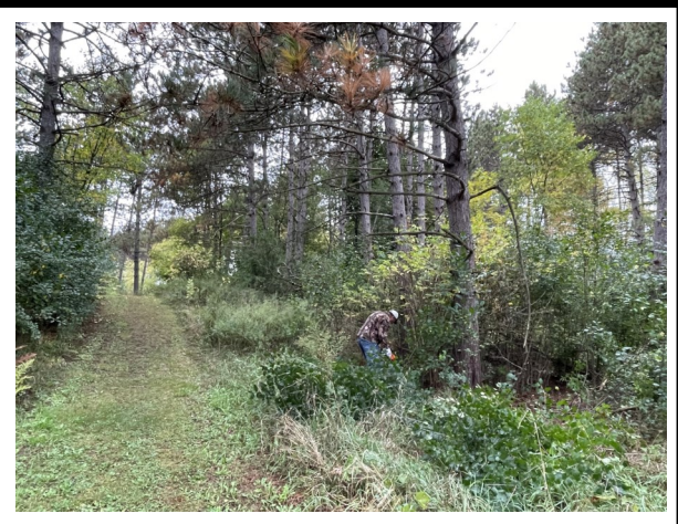
Control at Maple Hills with the help of Shawano LCD.

The coordinator has space available in her schedule for private landowners who want help identifying plants on their property, or consultation on how to remove invasives. Anyone who is interested in this should contact the coordinator to set up an appointment.