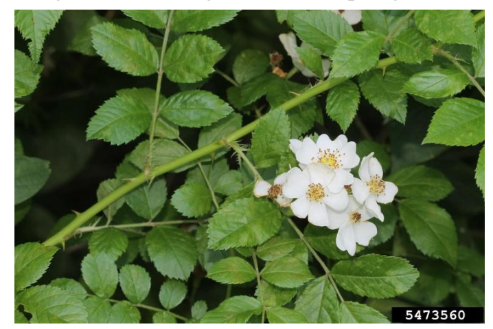
Multiflora Rose

If you spot multiflora rose on your property, contact TIP for resources on the ways to remove this invasive species.